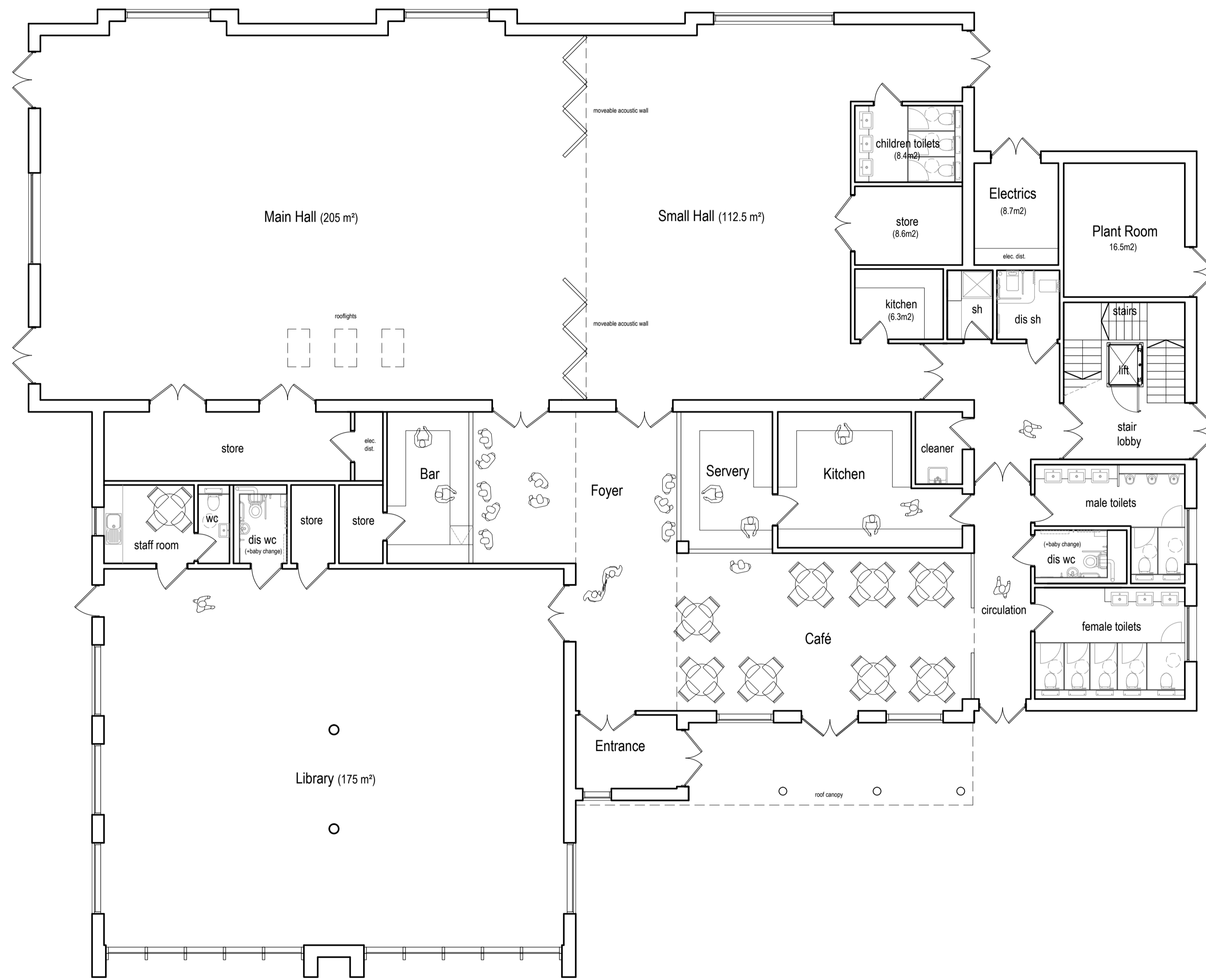
GROUND FLOOR PLAN GIA 858 m²