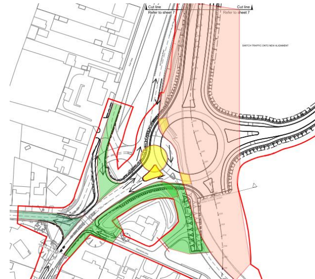
Figure 2 – New layout in affect during 18/10/17